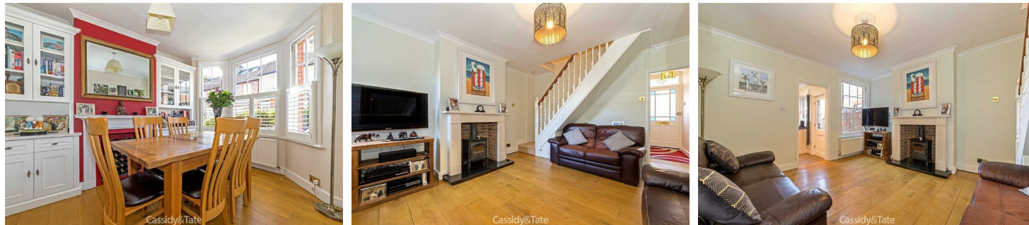
Ground Floor Approx. 438.3 sq. feet

Located within the conservation area is this superb Victorian three double bedroom, bay fronted mid terraced property that has been sympathetically refurbished to provide elegant and beautifully proportioned accommodation, whilst retaining a wealth of period detail. The property comprises of an entrance hall, dining room, living room, cloakroom, kitchen, three bedrooms and a family bathroom. Wood flooring starting from the entrance hall flows and connects the two reception rooms. The dining room is a bright room with box bay sash style window whilst the living room is a comfortable room with feature wood burner stove that lends a cosy ambience. The kitchen is fitted with shaker style wall and base units complemented beautifully by granite work top surfaces. Upstairs are three double bedrooms and a stylish family bathroom. The property further features an enclosed rear garden which is mainly laid to lawn with patio area and summer house. Ladysmith Road is quiet street conveniently located for ease of access to the city centre with its extensive shopping and leisure facilities, within the catchment of good schools and near to the mainline railway station. Should you be looking to further enhance the property, (stpp) the house has potential for an internal space of 1264ft giving the purchasers the chance of creating a fabulous home.